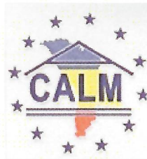
Congress of Local Authorities from Moldova